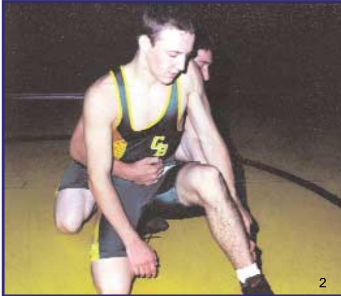
2 - The opponent posts the hand on the ankle and begins to stand-up.