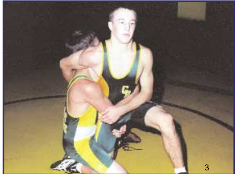
3 - The top man rotates to the right hand side of the body and drops his left hand in the opponent's crotch.