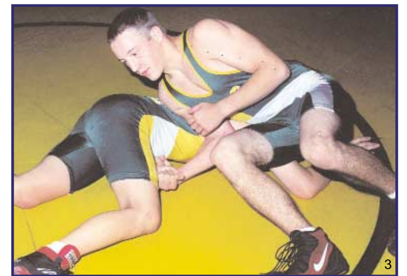
3 - The top man has jumped across and has secured the bottom man's left wrist with his right hand. The top man has all his weight on the bottom and is jamming his left shoulder into the bottom man.